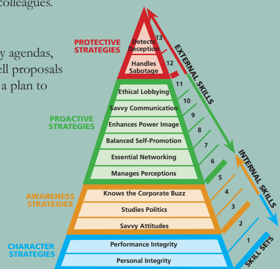
Organizational Savvy Skills Pyramid